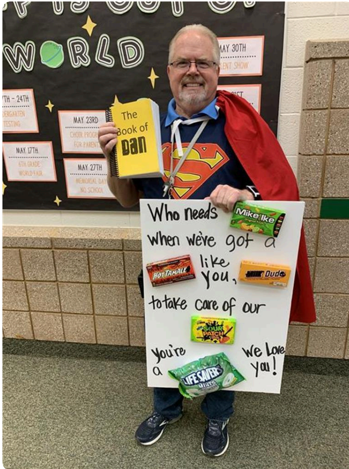
"Super Dan" -Custodian Appreciation Day 2019